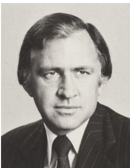
Hon. Andrew Peacock Leader of the Opposition 1983 - 1995, 1989-1990